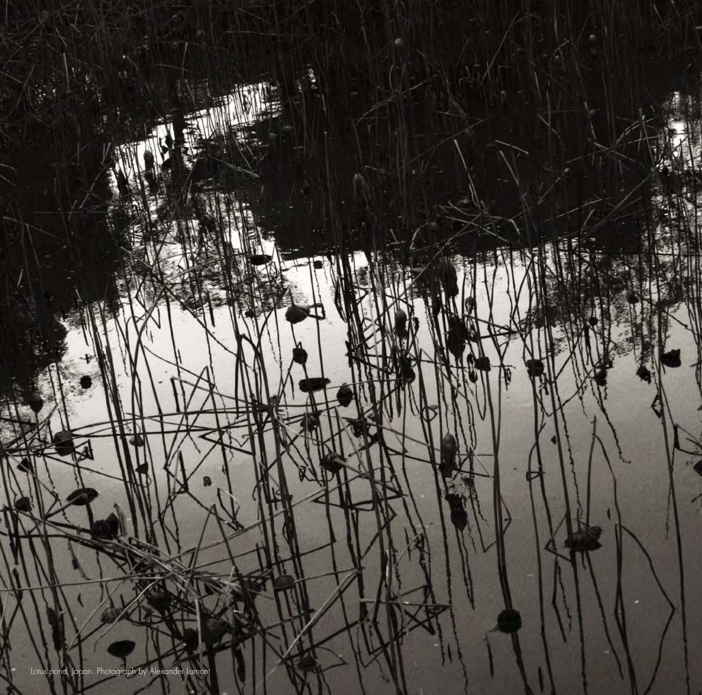
Lotus pond, Japan.

"Designs infused with vitality, soul and character"