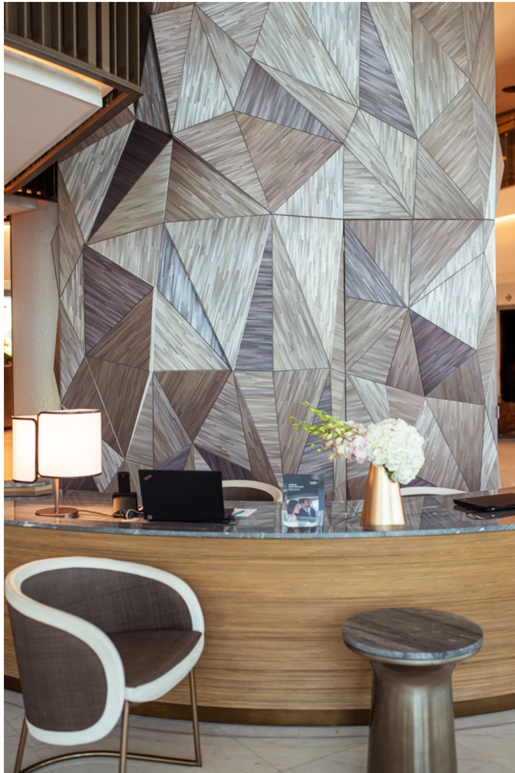
Project Name: Jumeirah Beach Hotel, Dubai. Designed by Engineering Office