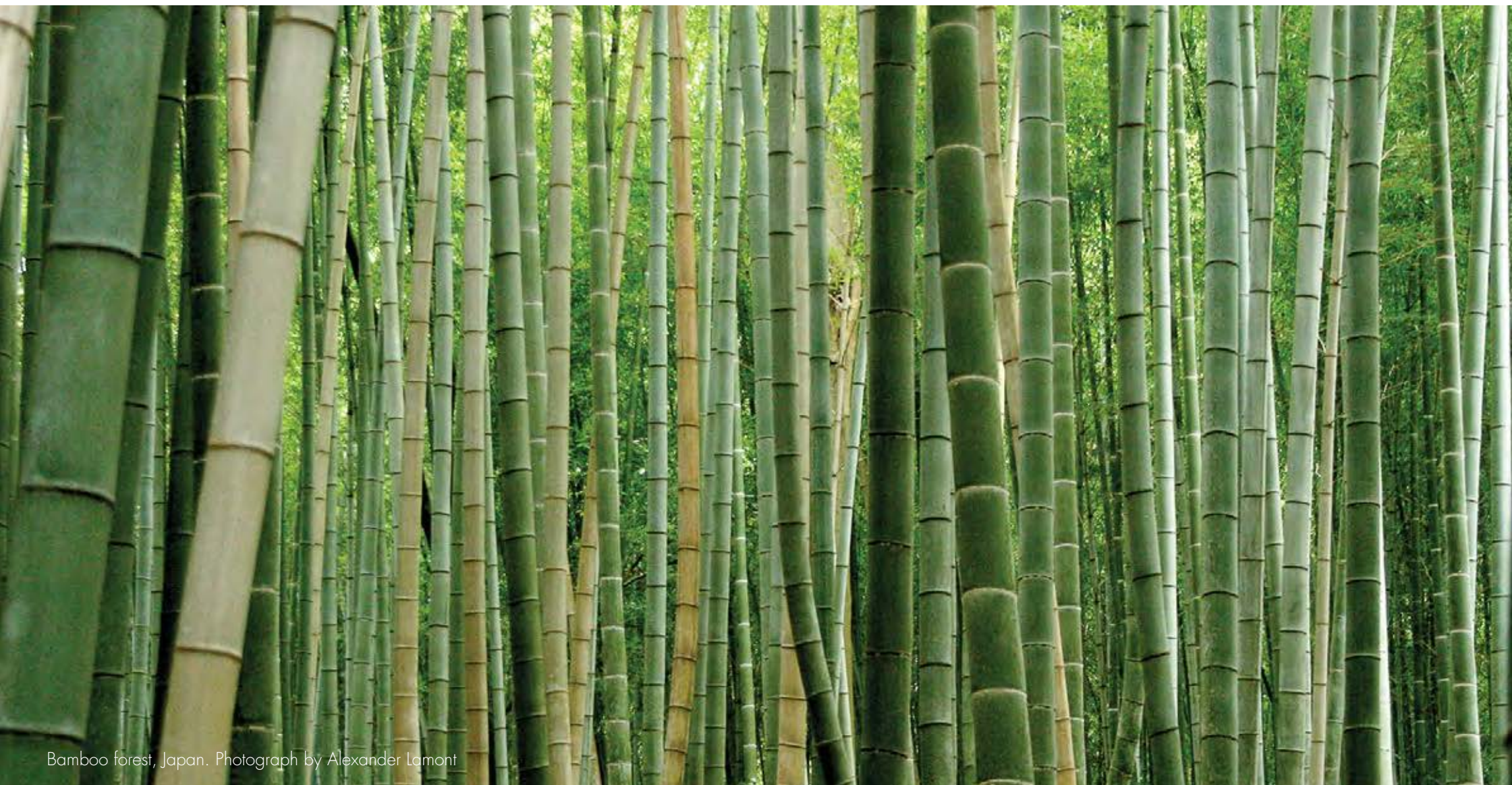
Bamboo forest, Japan.