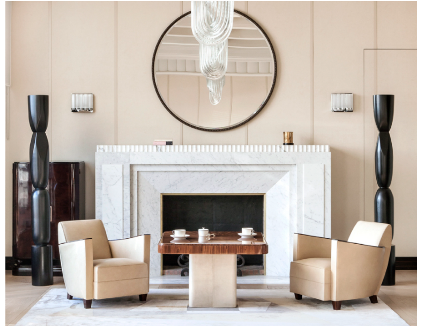
Project: Private Residential Art Deco Living Room (Avenue Montaigne, Paris) Interior design: Frederic Sicard