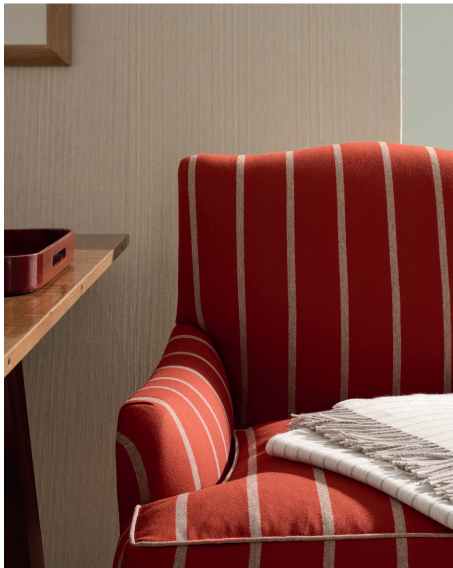
wallcovering Casanova Plain armchair Atlas and Altai plaid Gessato